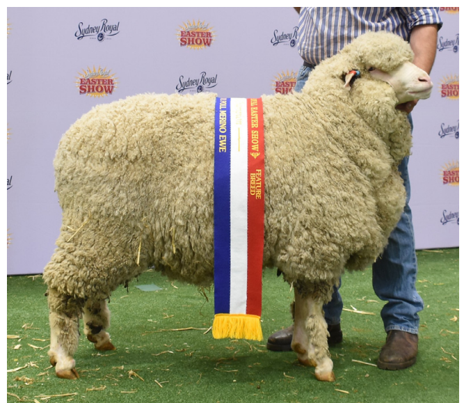
Grand Champion Medium Wool Poll Merino Ewe Champion Medium Wool March Shorn Poll Merino Ewe