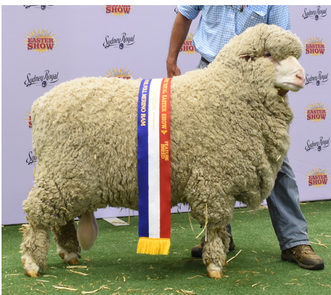
Grand Champion Fine Wool Poll Merino Ram Champion Fine Wool March Shorn Poll Merino Ram