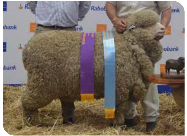
▲ Grand Champion Ewe and Supreme Exhibit by Uniform 44th 19.6 micron, cut 15kg