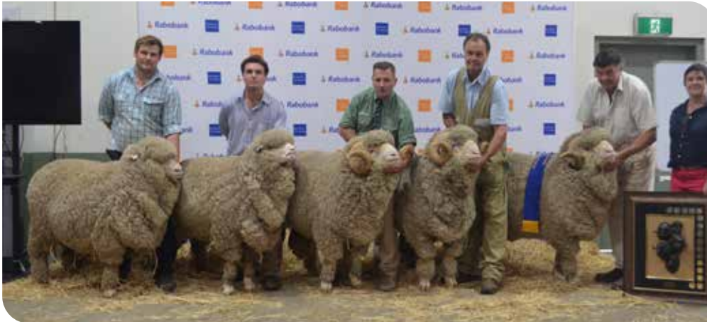
◀ Winners of the Roger Birtles Memorial March-shorn Group