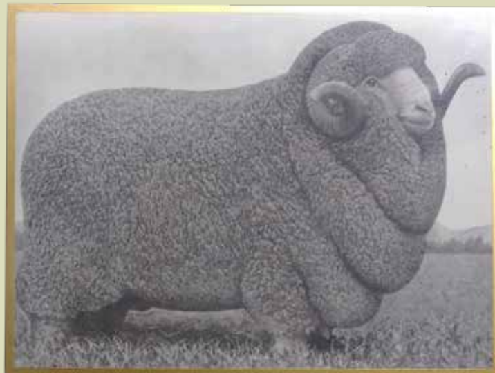
MERRYVILLE SILKY SNOWY