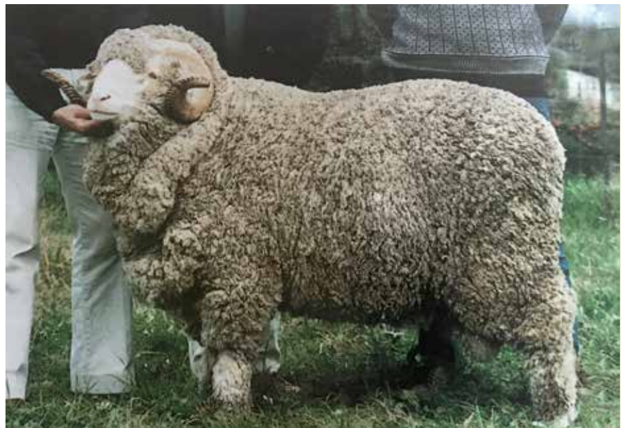
▲ Merryville Melbourne Monarch 'Anzac' 43 was purchased for $68,000 during the 1989 Melbourne Sheep Show and Sale.

He bred very well at Tara Park when joined to ewes bred from the Manderley Purple family and Mr Evans recalls the first drop of lambs were very impressive.